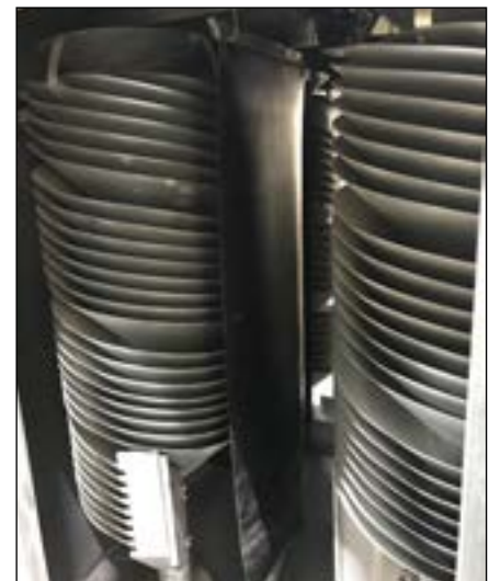
Each of the re-engineered Profile Industries spiral separators contain four cores to provide increased capacity.

Now, DeJong says the separators such as what were installed at Hurt Seed have four cores, which increases capacity.