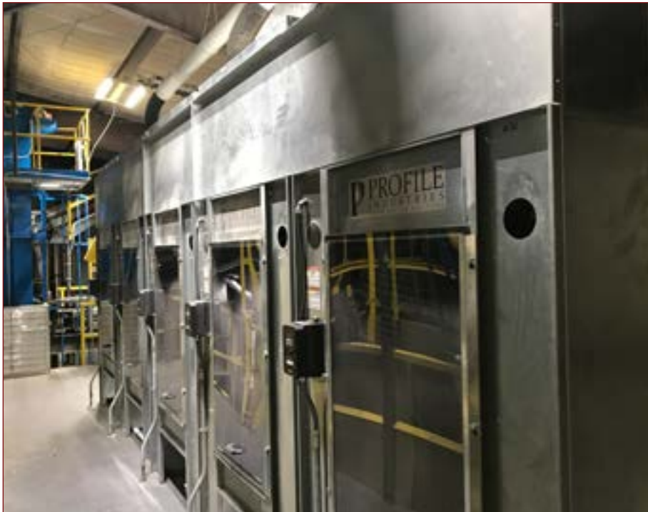
Rotary spiral separators were installed in August at the Hurt Seed plant in Halls, TN. The machines are designed to be cost effective and efficient to operate after being re-engineered last year.

Company redesigns rotary spiral separators to improve ease of use, yields